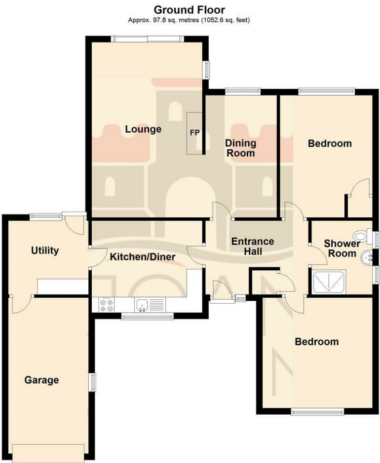
Total area: approx. 97.8 sq. metres (1052.6 sq. feet) This floor plan is for illustrative purposes only and may not be representative of the property. The measurements are approximate and are for illustrative purposes only. Plan produced using PlanUp.